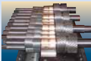
Dual herringbone gear train