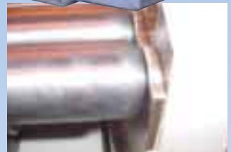
Floating full-width intermediate rolls