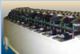
Manually adjustable leveler fixed upper back-ups for greater leveling control