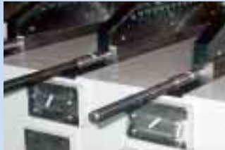
Lower wedge adjustment