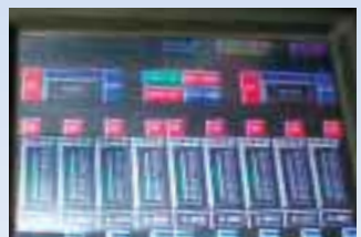
Pictorial touchscreen control provides ease of set-up and operation

2-Year Warranty Call 800-247-COIL for free brochure.