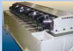
Leveler upper work rolls, heat treated to 62-64 Rockwell C scale