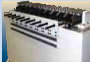
Lower power adjustable back-ups