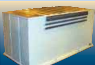
Stress-relieved, all-steel fabricated leveler base