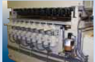
Leveler motorized back-up adjustment